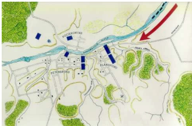
Map 1, Battle of Petersburg, 25 April 1781.

The British marched up the River Road (now known mostly as Puddledock Road) to the road junction, today known as Route 36 or East Washington Street, toward the town of Blandford (now east Petersburg). As they reached this point, Phillips saw the Virginia Militia drawn up on the east edge of Blandford, on the opposite bank of Poor's Creek. While it had been proven through past experience that the Virginia militia would frequently "fire two volleys and run like hell," Phillips was not about to take this defensive line for granted. They had the appearance of standing fast, and looked "prepared to fight."