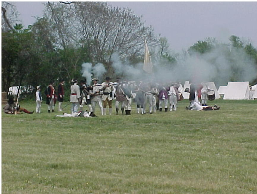
Virginia Militia defending Petersburg during the city's annual reenactment of the Battle of Petersburg, Virginia. City of Petersburg.