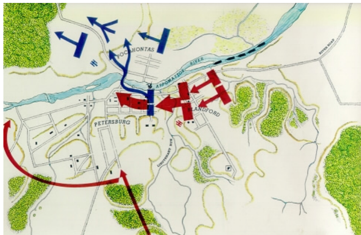
Map 3, Battle of Petersburg, 25 April 1781.

As the American first line reconstituted itself with the second line, along the western hill-crest above Lieutenant Run valley, the British army regrouped itself on a new line along the present North Crater Road. Phillips then ordered an assault against the (now) four regiments of militia across the valley. Several attacks were repelled by a withering fire from the Virginians.