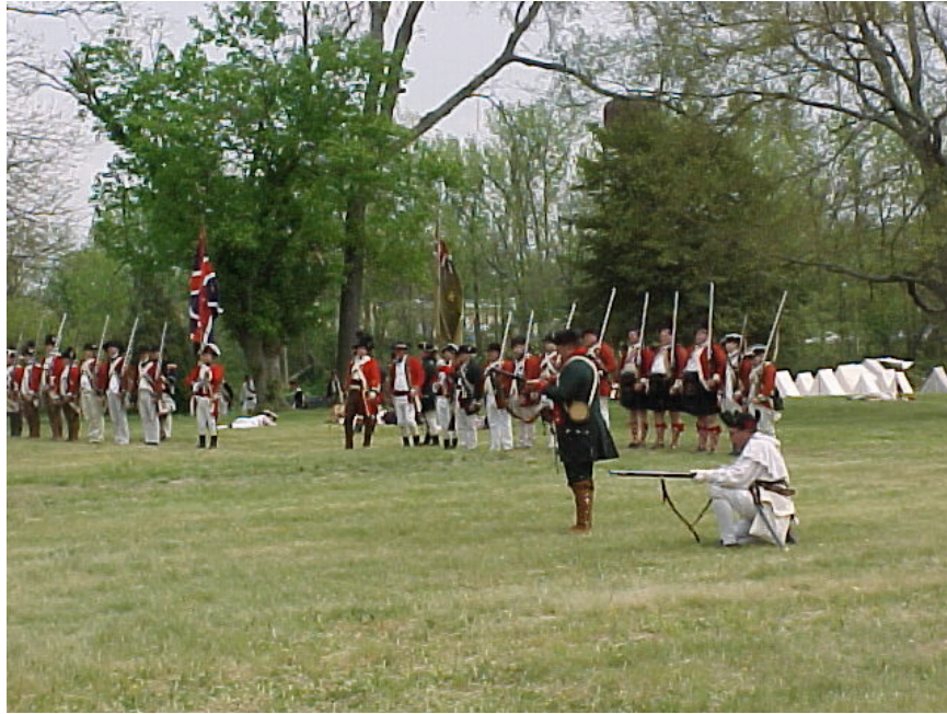
British forces advance on Petersburg during the city's annual reenactment of the Battle of Petersburg, Virginia. City of Petersburg.